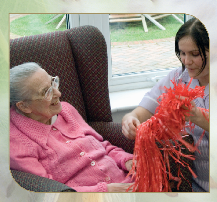
Because we care...